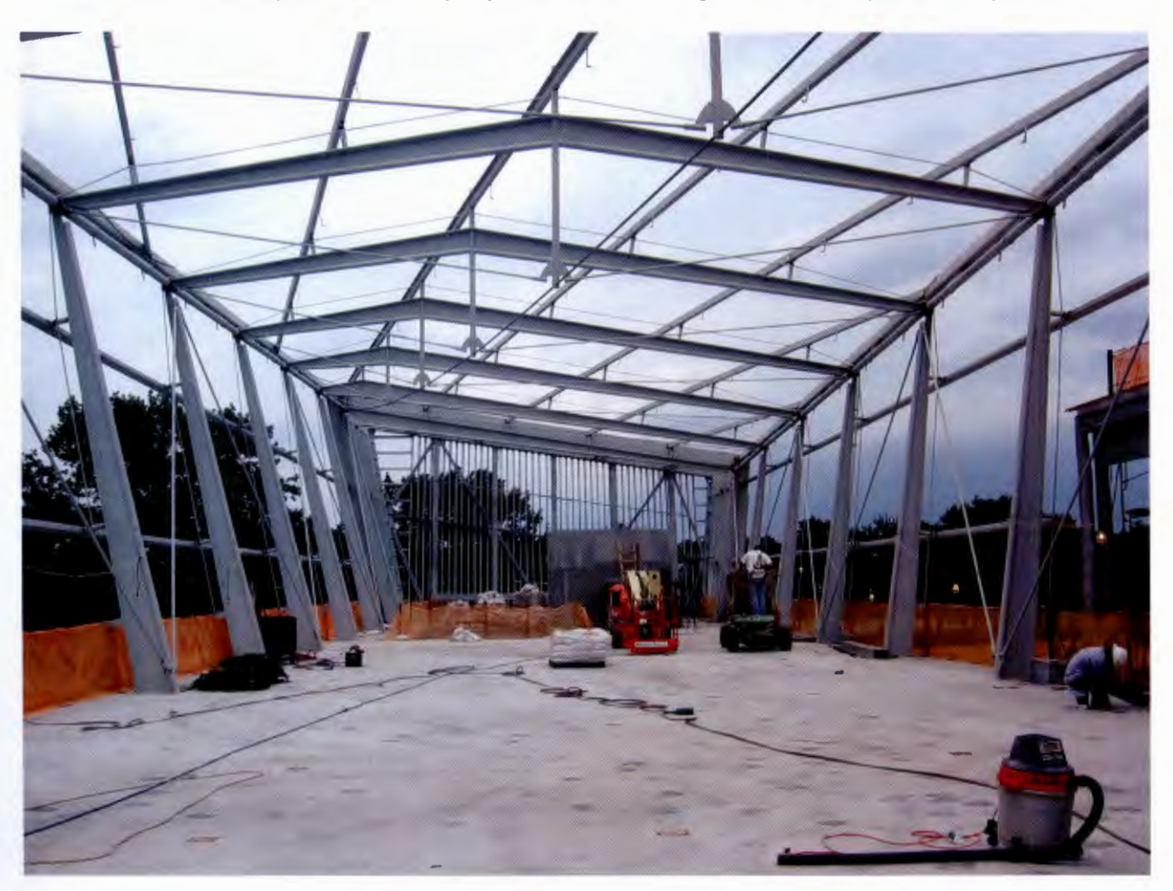
PREVIOUS The addition's expressive steel structure and translucent cladding give the Hall it's name.

King post trusses, composed of wide flange top chords, 4-inch pipe posts, and 1/4-inch diameter rods for bottom chords, support the roof. The top chords of the trusses are similar in form to the columns—a cut wide flange with a pipe welded to the web-except they're cut from lighter beams: 27W129s. As with the columns, this allowed for a more affordable fabrication, with each top chord fabricated from the same geometry, only cut at a different place to meet the diagonal pitch of the roof. The rods that run from the king post back to the wall also add to the flexibility of the system. They are high-strength rods, the same material often used as rock anchors in concrete construction, but smooth and fretted at the ends. Says Sesil, "We used this material because you could get them in lengths of up to 50 feet," or the exact width of the Hall. The rods thread into receiving couplers at the edges and are anchored through the top chord of the truss by means of a sheave. To make the roof structure more robust, a 1 1/2-inch structural strand cable catenary runs the length of the Hall through the bottom of each king post, providing an alternate load path between pieces.