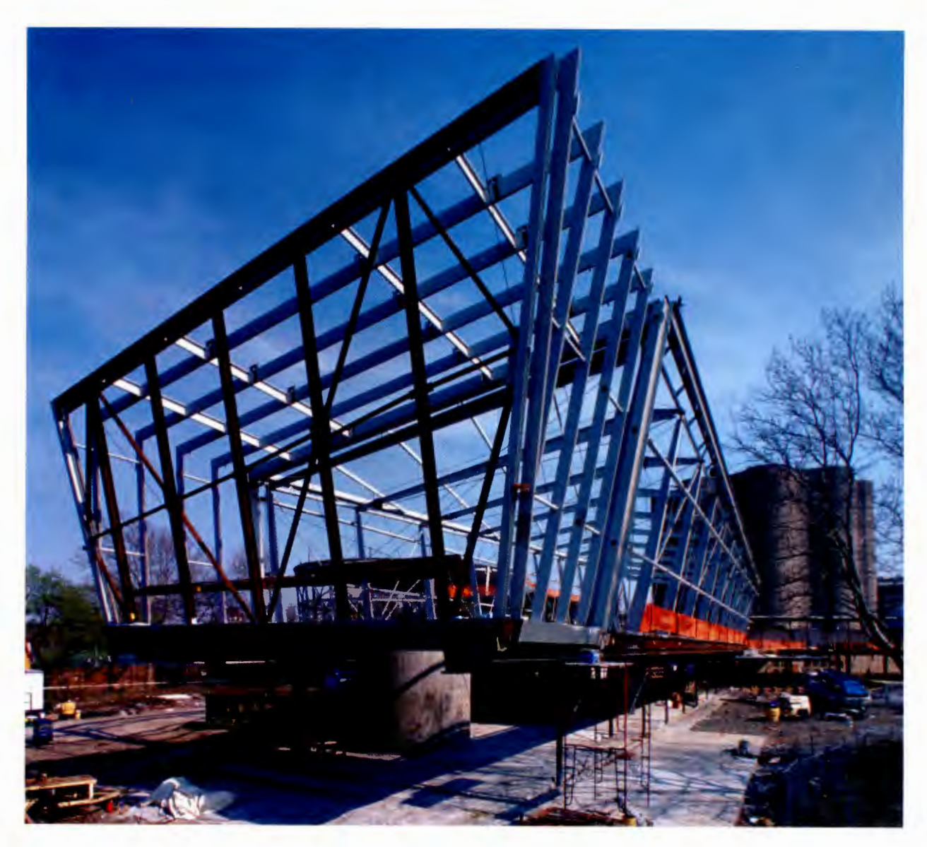
Steel offers a structural system light enough to handle poor soil conditions and can be erected more quickly than reinforced concrete construction.

ABOVE Where the addition cantilevers 20-feet off it's base on steel girders, a system of steel plate bents takes over the framing.