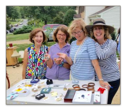
We did it. Our mighty team effort netted us the funds for our new sound system.