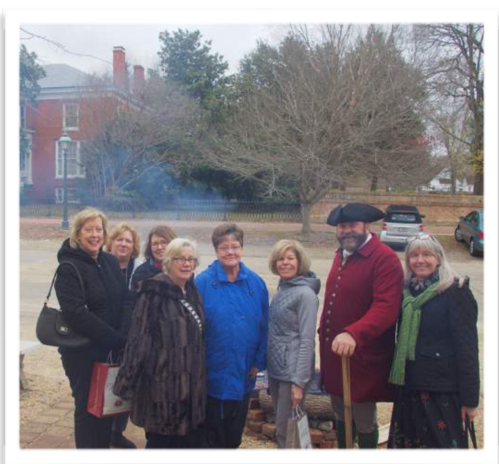
Can you spot our new garden club member?