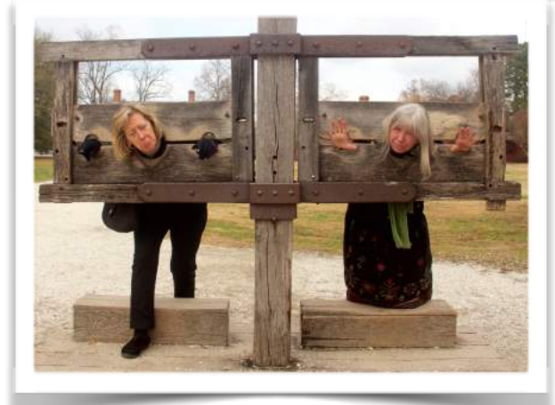
Colonial justice for wicked villagers