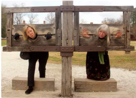
Colonial justice for wicked villagers