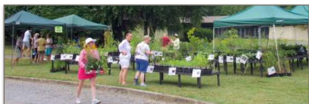
2016 Native Plant Sale at Morven Park, Leesburg, held by Loudoun Wildlife Conservancy. Participating nurseries were Nature By Design, Hill House Farm and Nursery, and Watermark Woods.