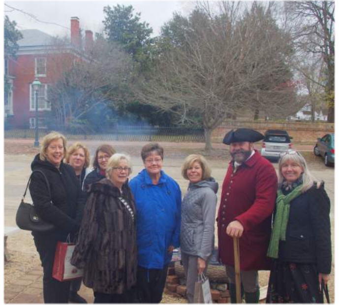
Can you spot our new garden club member?