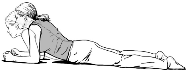
Figure 3 Sphinx posture.