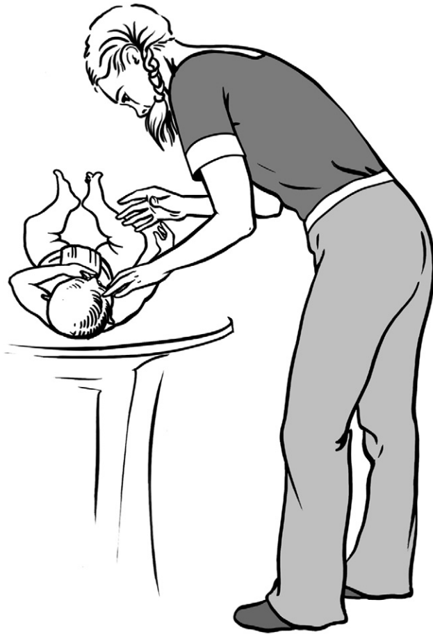
Figure 2 Bending forward posture to avoid.