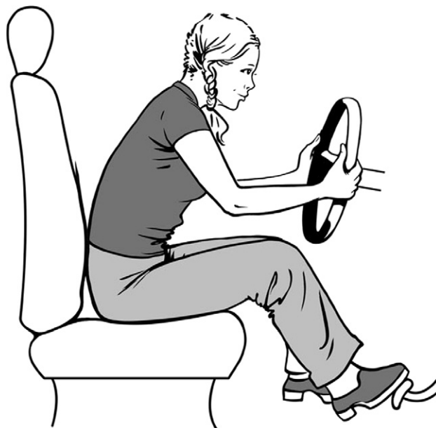
Figure 1 Prolonged sitting postures, especially while driving should be minimized.