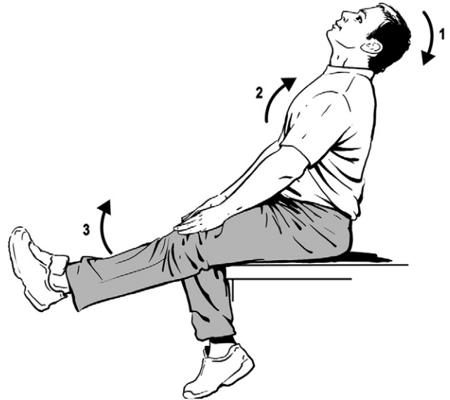
Figure 4 Sciatic nerve slider – Phase 1.