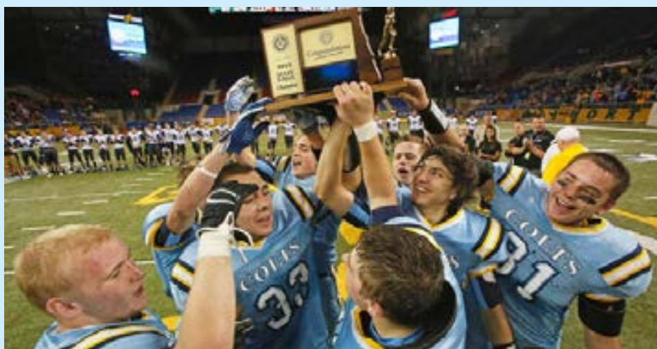
Pictured Above: Members of Richland High School's football team hold their 2015 NDHSAA 9-man state championship trophy.