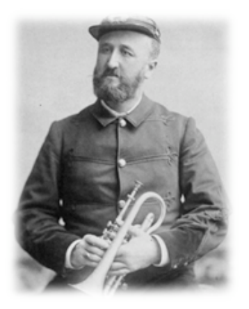
Charles Ives, Composer