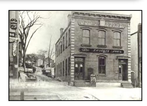
Danbury News Building

Danbury grew and had many buildings, including hotels, and restaurants. In 1865, the newspaper, Danbury News , started circulation. In 1874, houses and buildings were