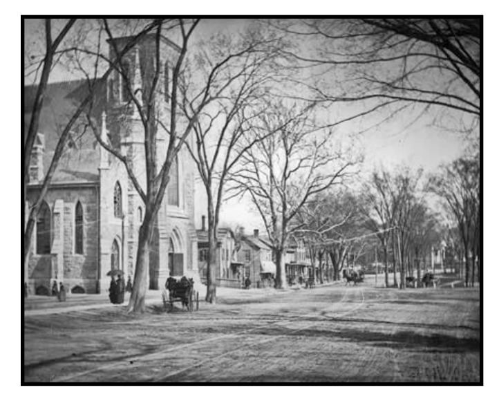
Main Street in 1875 - St. Peter's Church is on the left