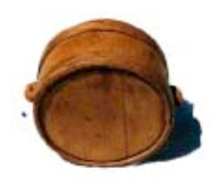
Supplies, such as this powder keg, were stored in the supply depot.

Not all the colonists were happy with England making all the rules for America. The Americans who believed that we should be a separate country were called Patriots or Rebels. The Americans who wanted to stay part of Great Britain were called Tories or Loyalists.