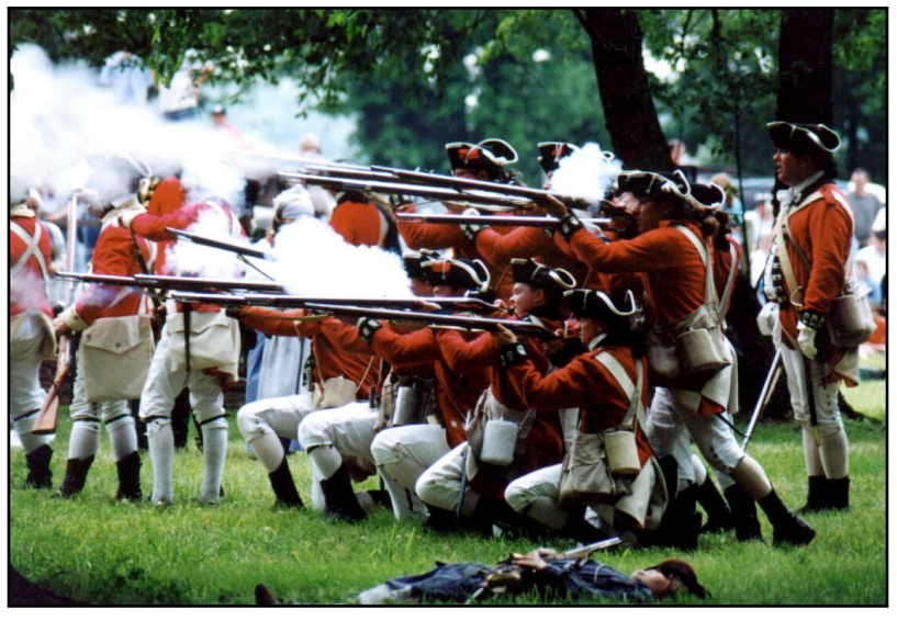
British soldiers were sometimes called "Redcoats" because of their red uniforms. They burned much of Danbury to prevent the townspeople from helping the patriots.

When they got to Danbury, they started searching for the supplies. They took the supplies they couldn't carry out into the middle of the street and set fire to them. The British burned homes, the New Danbury Church, and more than 20 other buildings. British troops tried not to burn Tory houses, because Tories were loyal to Britain. The Tory houses were marked with a red cloth.