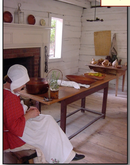
Danbury also had many craftsmen and women making goods for the war and to sell to other colonists.