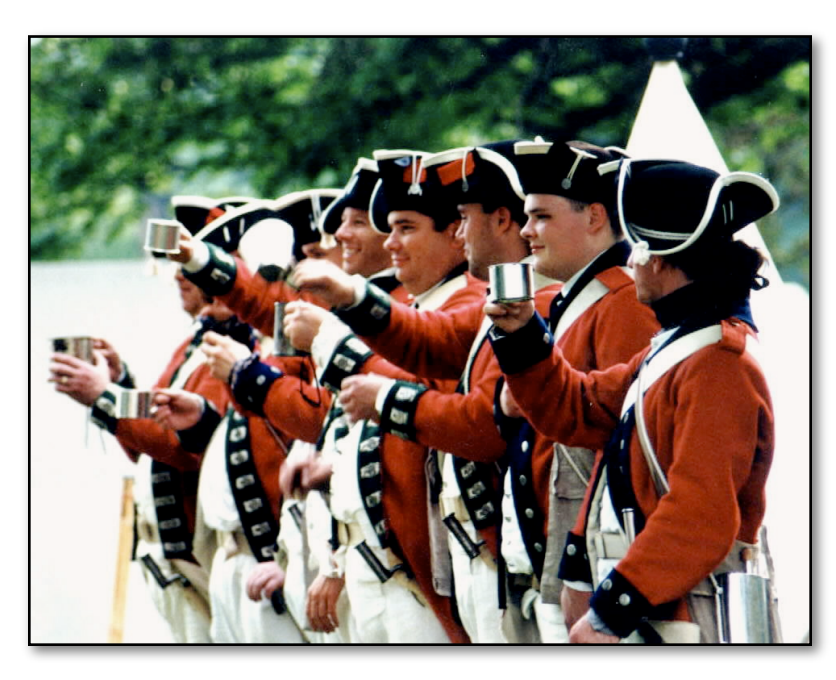
The British soldiers were from England. They fought to keep America part of Great Britain.