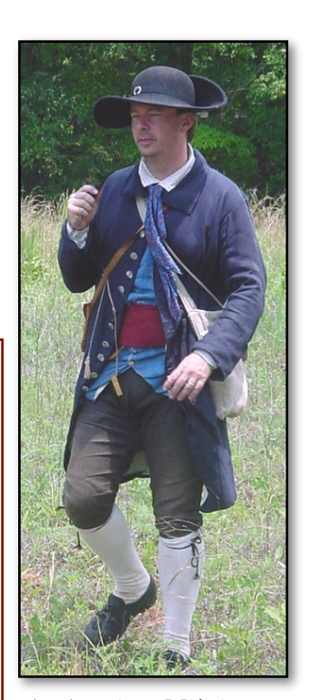
An American Militiaman.

A supply depot was located in Danbury for the Patriots in the Continental Army. Danbury was on a river, had flat roads, and was protected by small hills. It was away from the ocean, where the British soldiers landed their ships. There was a military hospital on Park Avenue. Thousands of soldiers passed through the town. These things made Danbury a good, safe place to store military supplies.