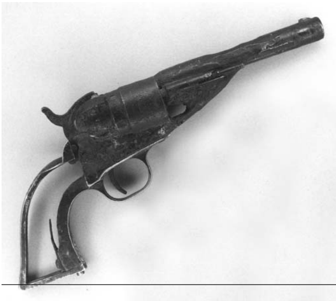
1862 Colt Police Model Pistol