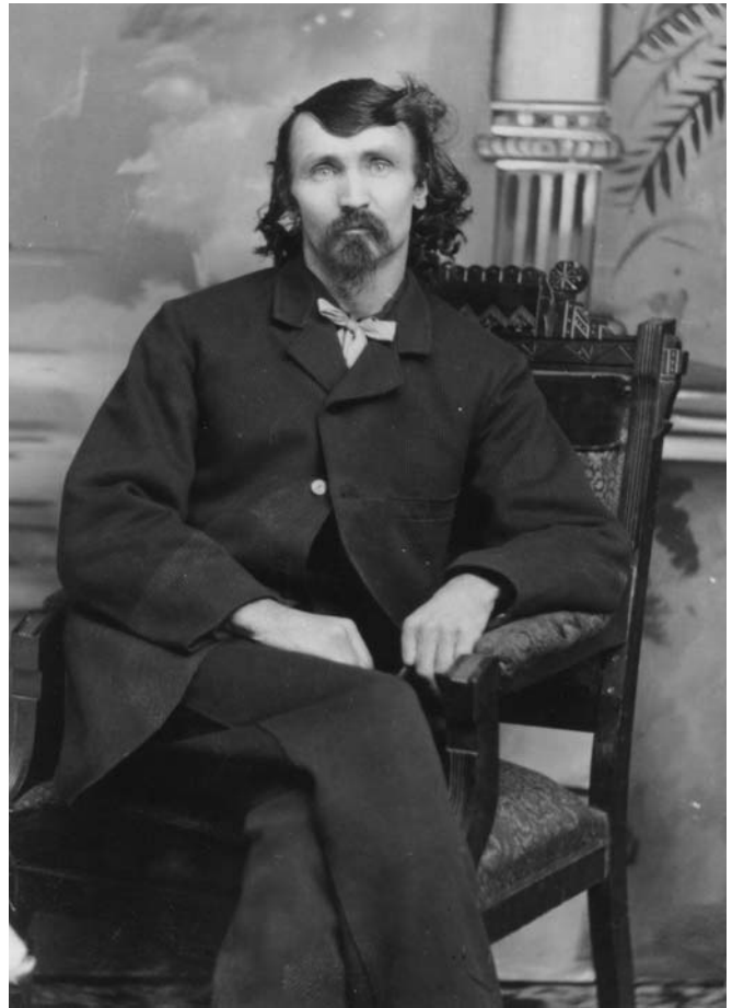
Alferd Packer before his trial in Lake City