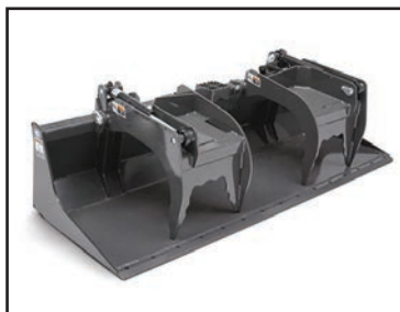
Grapple - Scrap

Takeuchi now offers attachments for all of your Takeuchi equipment. See your authorized Takeuchi dealer for additional information and attachment options.