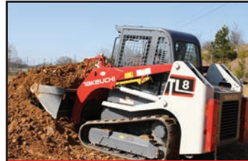
Active Power Control