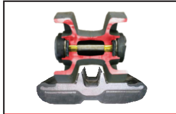
Steel on Steel