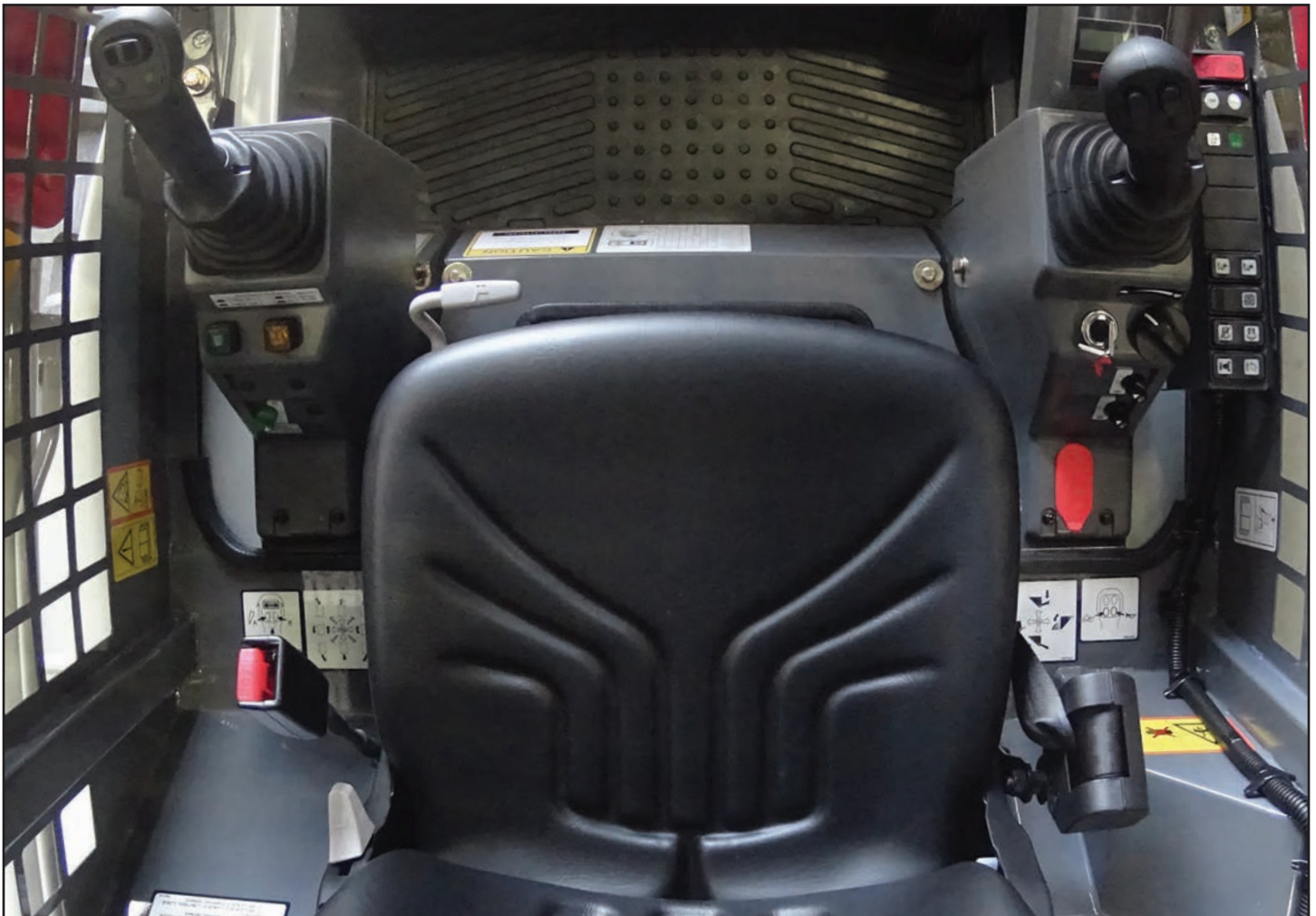
Spacious operator's platform with easy to reach controls and switches.

The TL8 offers a heavy duty rear door that swings out providing access to the high capacity cooling module while the tilt back cab / canopy provide access to the clustered engine oil filter, primary, and secondary fuel filters, pump group, control valve, and pilot line filter. Takeuchi quality and functionality ensures the TL8 will deliver many years of trouble free service in the most extreme conditions.