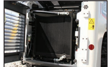
HD Cooling Module

Powerful and efficient, the TL8 is engineered to provide excellent maneuverability, performance, and value. The heavy duty cross member, two-speed travel, and hydraulic self-leveling are standard equipment on the TL8. Operator controls include a multi-function display, hydraulic pilot controls, foot throttle, and a high back suspension seat. The TL8 provides ample space and comfort for your time on the job.