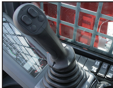
Pilot Operated Controls