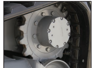
Double Reduction Drives