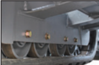
Fully Welded Frame