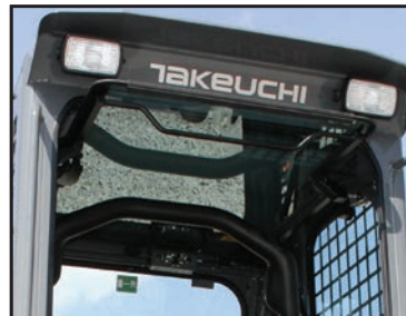
Roll Up Door