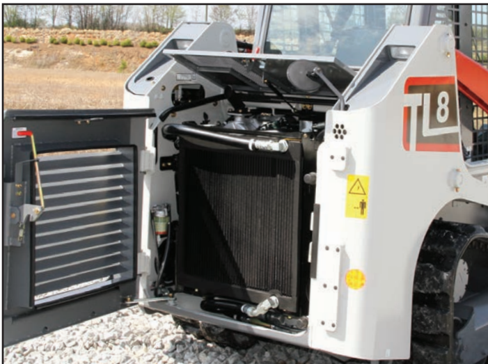
Convenient Service and Maintenance Access