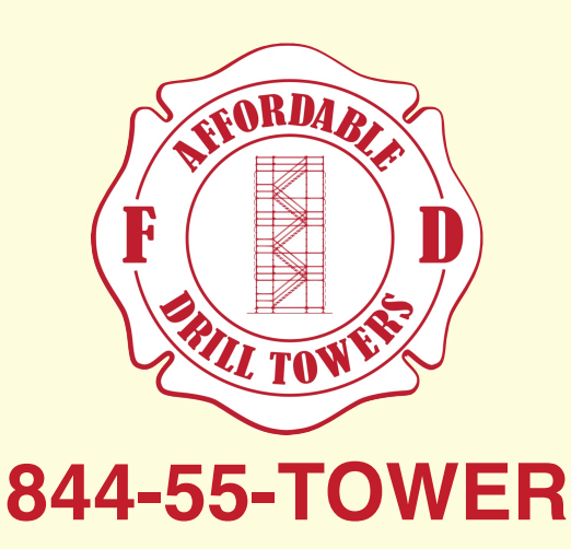
3rd Party Tested by Element Materials Technology