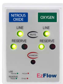
Remote Alarm/Controller (RAC)