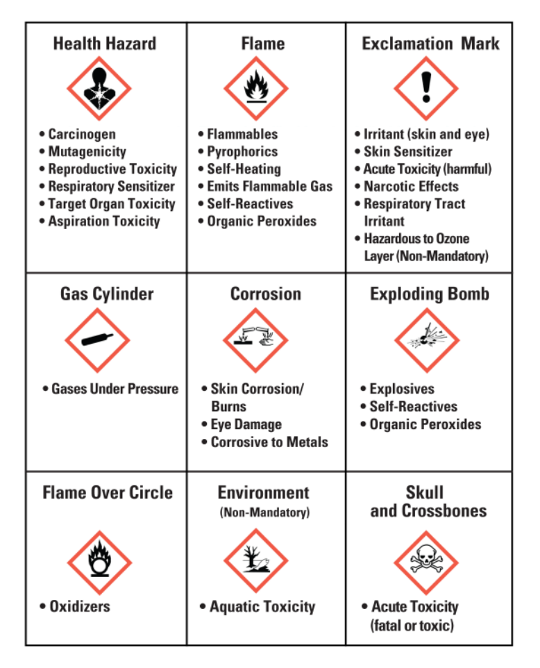
Figure 1: Pictograms and Hazards

It is important to note that the OSHA pictograms do not replace the diamondshaped labels that the U.S. Department of Transportation (DOT) requires for the transport of chemicals, including chemical drums, chemical totes, tanks or other containers. Those labels must be on the external part of a shipped container and must meet the