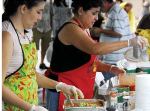
11th Annual Old Town Salsa Fiesta September 12, 2015 Noon-7pm