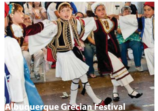
Albuquerque Grecian Festival October 2-4, 2015