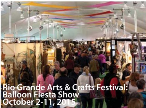
Rio Grande Arts & Crafts Festival: Balloon Fiesta Show October 2-11, 2015