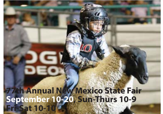
77th Annual New Mexico State Fair September 10-20, Sun-Thurs 10-9 Fri-Sat 10-10