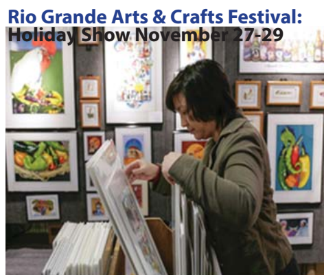
Rio Grande Arts & Crafts Festival: Holiday Show November 27-29