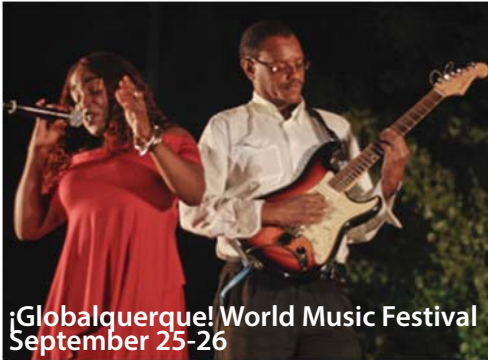
Globalquerque! World Music Festival September 25-26