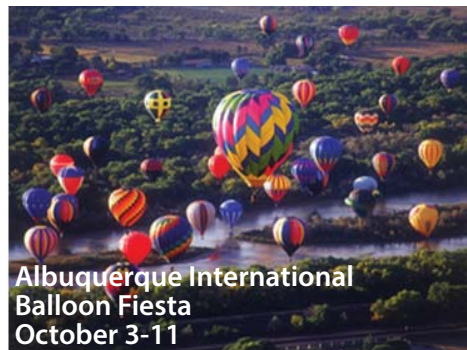
Albuquerque International Balloon Fiesta October 3-11