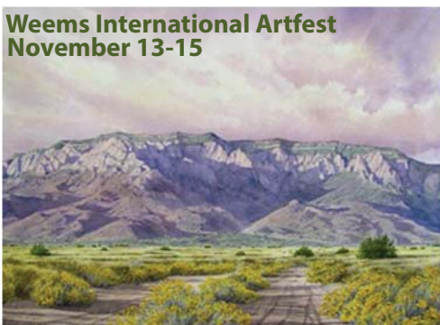
Weems International Artfest November 13-15