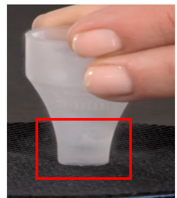
Cryogen Accumulation Zone