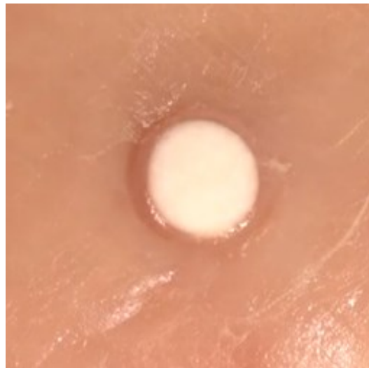
Ice Ball from Perfectly Contained Freeze within Isolation Funnel– No Leakage

6) DO NOT TOUCH the frozen area for at least 40 seconds, and allow the skin to thaw naturally and return to normal color.