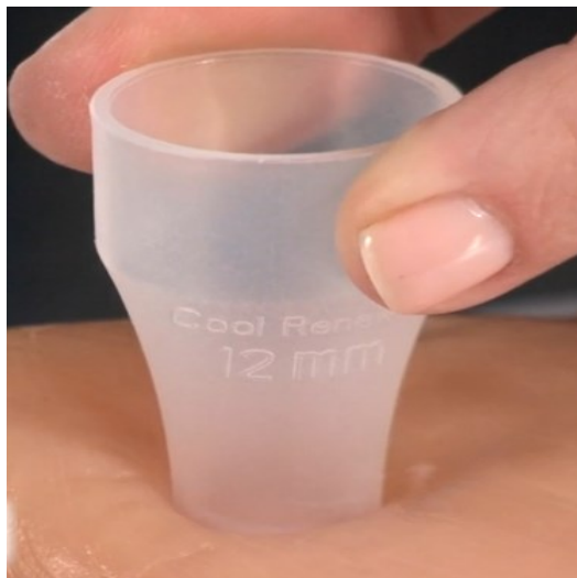
Press Down to Make A Seal

2) Place the smaller end of the Funnel over the lesion being treated and press down to make a tight seal around the affected area. This allows the cryogen to accumulate on top of the treatment area for the recommended 20-40 seconds. If a tight seal cannot be achieved, and cryogen is leaking onto the surrounding area, STOP USING THE ISOLATION FUNNEL and USE A FOAM TIPPED APPLICATOR. Accumulation of cryogen inside the funnel is CRUCIAL for tissue destruction.