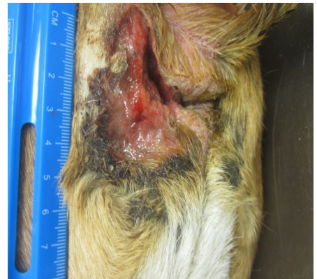
Skin after mass removal– May 13, 2016