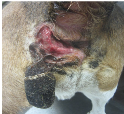
Necrotized Mass– May 13, 2016