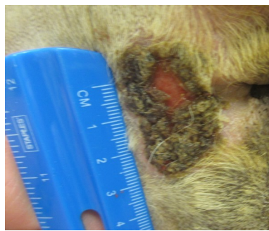
Healing Skin– May 26, 2016