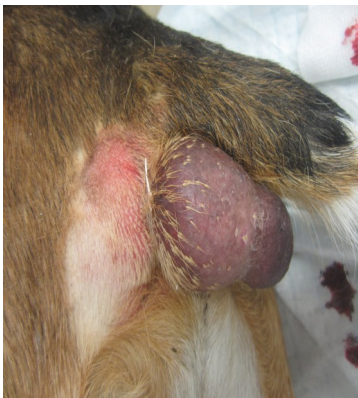
Ligated Mass — May 6, 2016

Patient was nervous- administered 40mg of Benadryl, 0.6 mls of DexDomitor IV. Shaved and prepped area in a sterile manner. Injected Lidocaine at the base of the stalk. Ligated with 2 Braunamide sutures at the base of the mass. Applied Vaseline to the edge of the isolation funnel before applying to skin to prevent leakage. Sprayed entire mass and base with Cool Renewal cryogen several times . Administered 0.89 mls of Metacam 5mg, & 0.6 mls Antisedan IM– Follow up every week for 6 weeks.