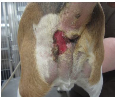
Healing Skin– May 20, 2016