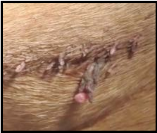
Skin Tag Before Treatment