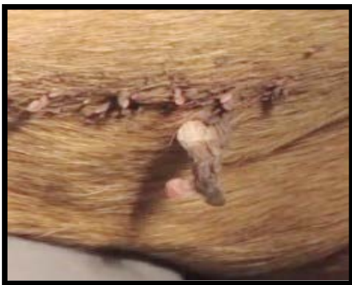
Frozen base of tag immediately after application of cryogen.