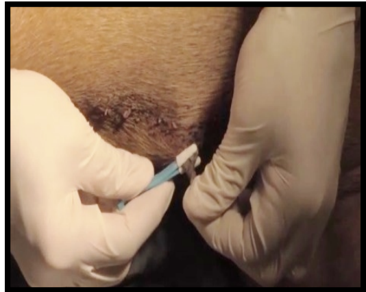
Skin Tag being frozen at the base with Skin Tag Tweezers, eliminating blood supply to tag.