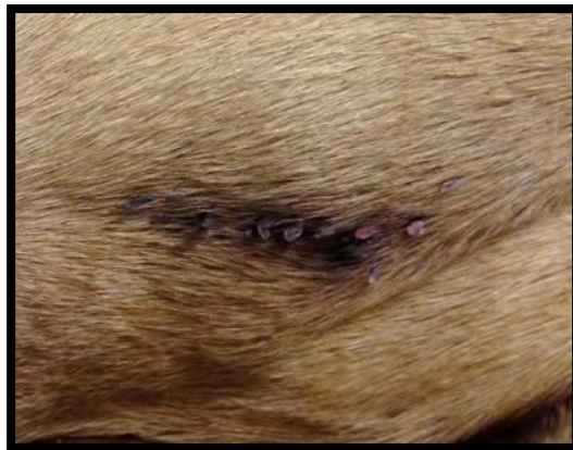
45 Days After Treatment

To view the complete treatment video, please visit http://www.cool-renewal.com/demonstration-video.html