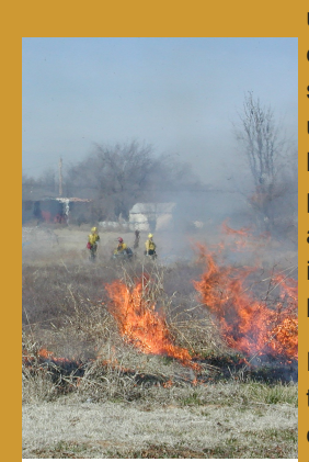
Burning can reduce hazardous fuels.

O klahoma's ecosystems are nearly all firedependent. Fire helped shape the plant communities that we depend on for grazing, hay, wildlife, wood products and water quality. Native Americans long