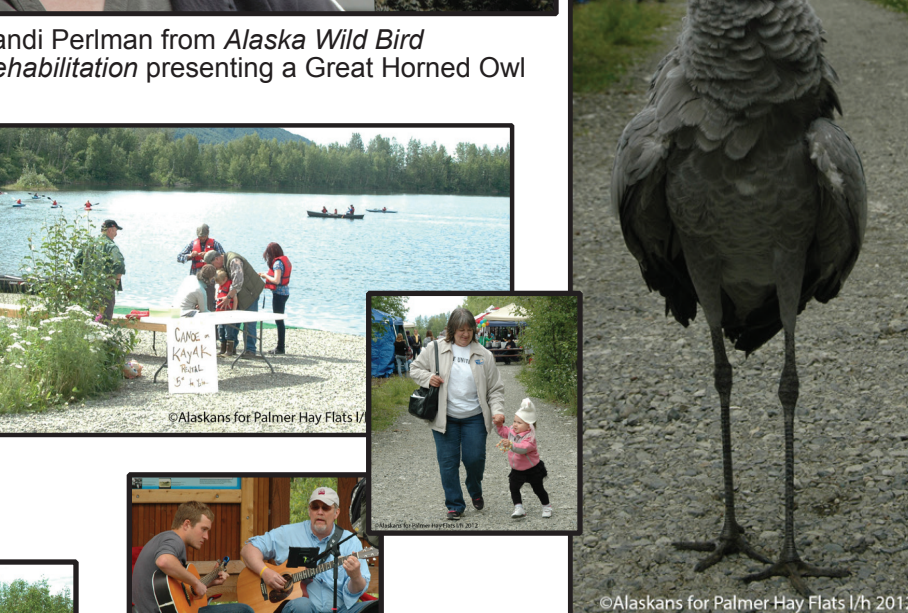
Lesser Sandhill Crane