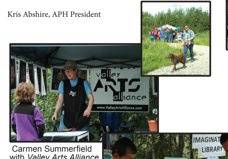
with Valley Arts Alliance