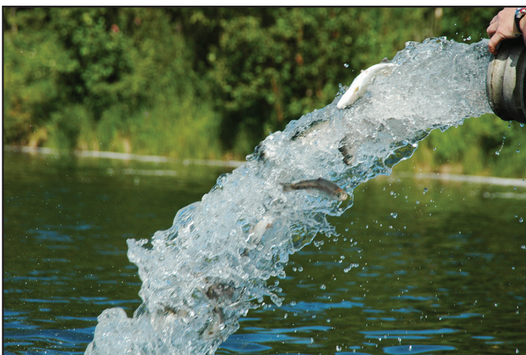
Rainbow Trout being released by ADF&G into Reflections Lake.

On Friday, July 6, the Alaska Department of Fish and Game (ADF&G) released 600 yearling Rainbow Trout into Reflections Lake. It is the first of a series of releases in the Fish and Game release plan.