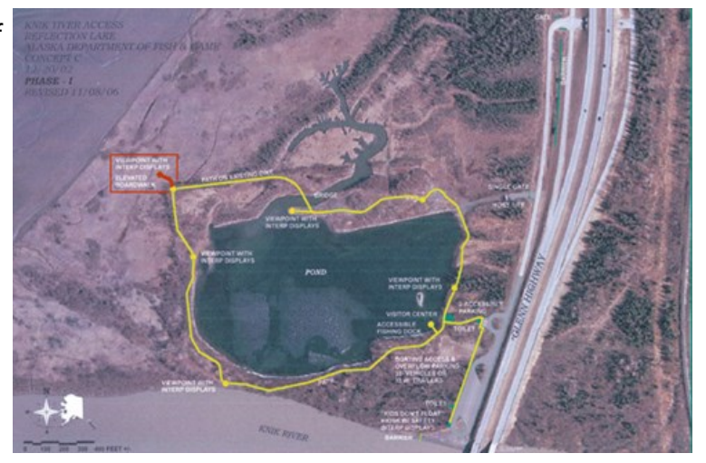
On this proximity map, Red marks the spot of the of the Tower's northwestern Reflections Lake area trail location.

tained. The great intersection of the massive natural forces of land and sea at the Reflections Lake area could be even more appreciated by enhancing educational opportunities from an elevated perspective. A thoughtful review of elevated viewing tower designs led the group to the selected concept. The Anchorage firm of BBFM Engineering, Inc. was retained by APH to provide design drawings for the Tower. BBFM has been an integral paid contractor, and continues to donate in-kind services and reduced fees as an important