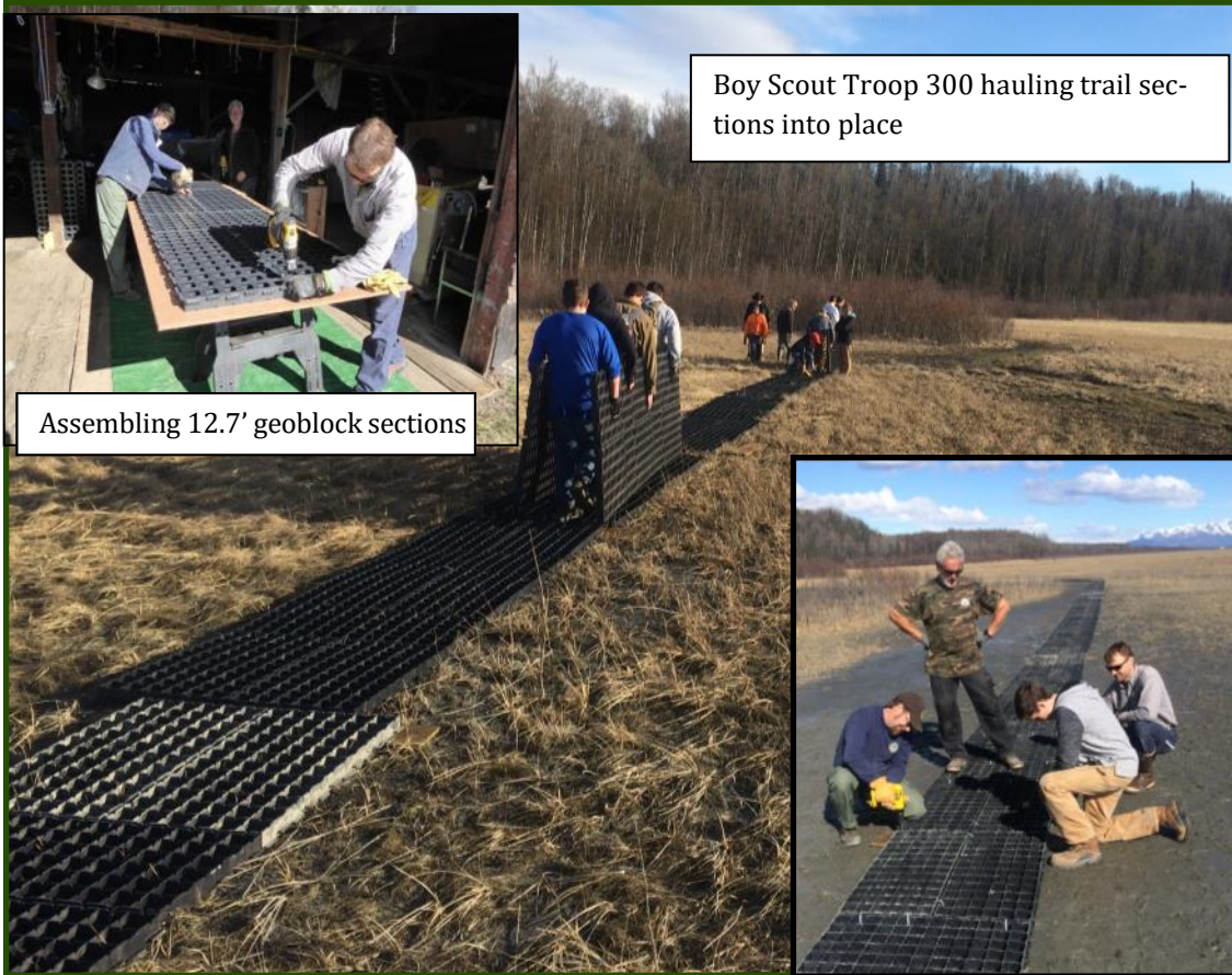
Boy Scout Troop 300 hauling trail sections into place