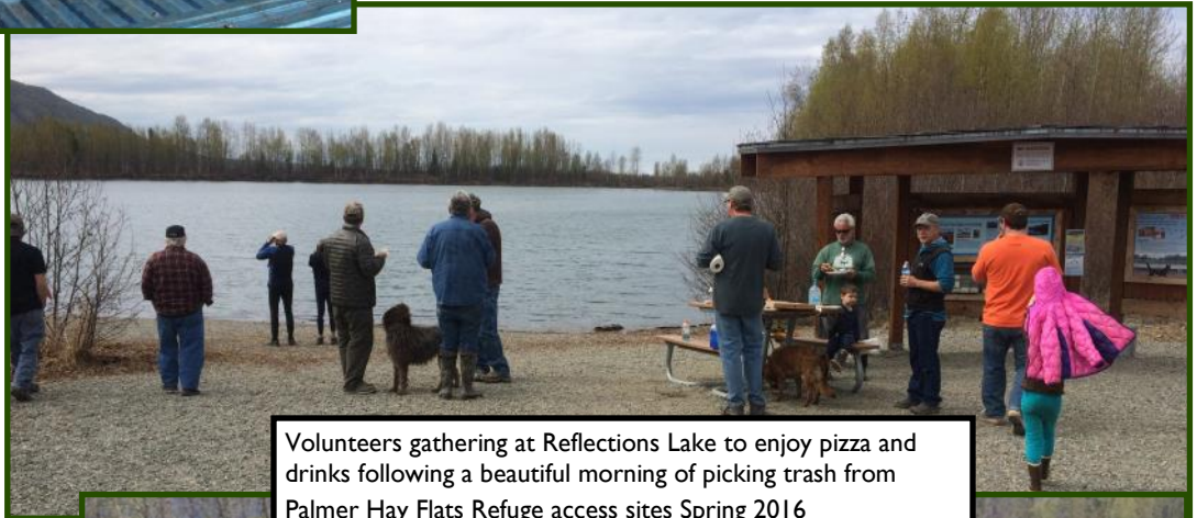
Volunteers gathering at Reflections Lake to enjoy pizza and drinks following a beautiful morning of picking trash from Palmer Hay Flats Refuge access sites Spring 2016

Next spring think about coming out with us and enjoy good company, exercise and knowing your efforts beautify the refuge for all to enjoy.