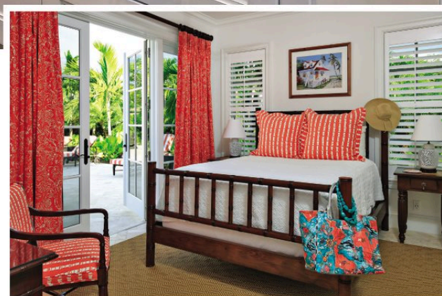
Coral accent pillows, draperies and chair upholstery add color to a bedroom in the pool house. French doors open to the patio.