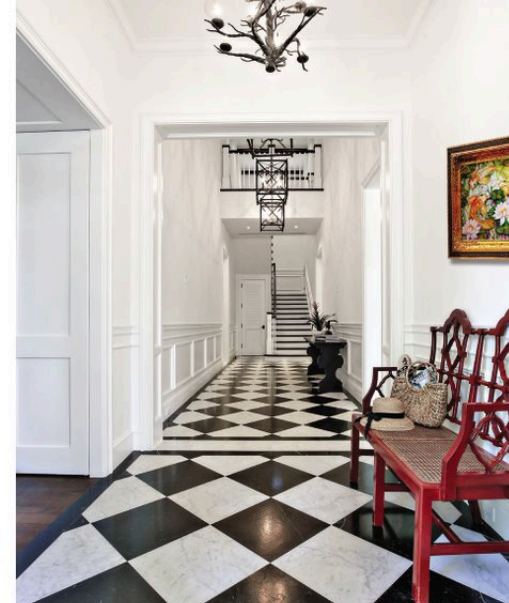
Black and white marble tile flooring lines a hall that goes from the front to the back of the house.

In contrast to the pristine white workspace, the breakfast area has dark wood cabinetry and a dark wood table that seats six. Chairs with bamboo frames have cushions covered with a coral and white print, and linen draperies are coral with white appliqué.