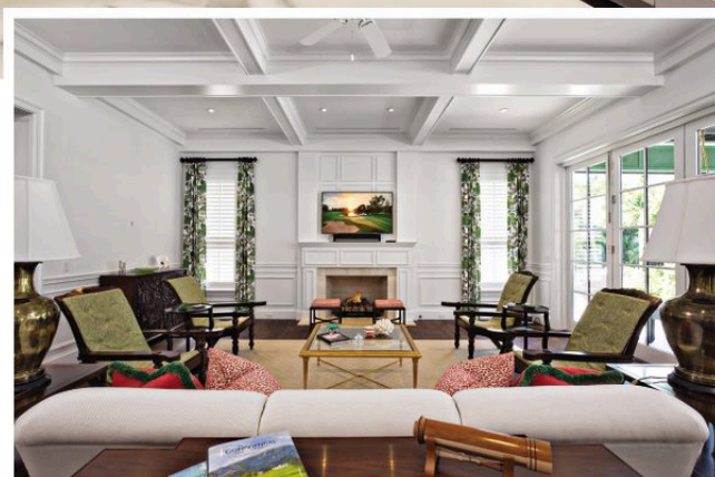
In the living room, glass doors fold back completely to make the interior and outdoor lanai one space. Green and white draperies with a coral berry pattern add color.