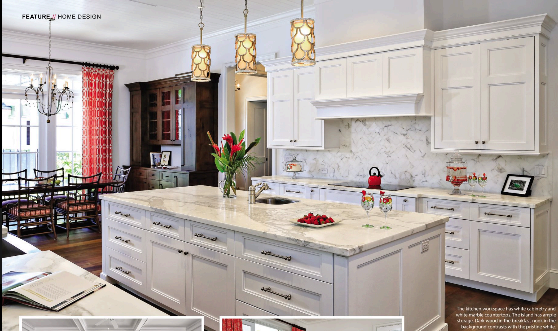
The kitchen workspace has white cabinetry and white marble countertops. The island has ample storage. Dark wood in the breakfast nook in the background contrasts with the pristine white.