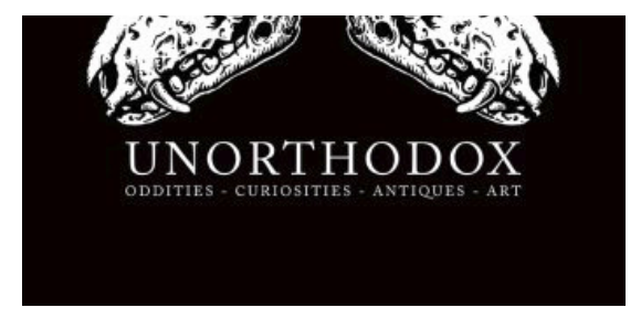
Unorthodox opens Saturday at 1207 S. Sixth St.

There's a dog heart in a glass case, suspended in the air as if floating. There is a deer tongue in a phial filled with viscous liquid. There is a peacock lording over the small jars containing unknown bones. There is a tiny taxidermy mouse, dressed in a witch's garb. And there is a devil