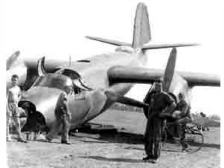
Undignified ending for a Marauder

Nevertheless, despite its high stall and landing speeds (which remained essentially unchanged despite numerous modifications made to reduce them), the Marauder had no really "vicious" flying characteristics, and its single-engine performance was actually fairly good for the day.