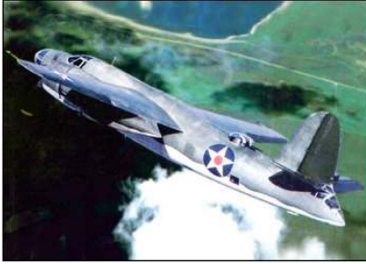
The lowest combat loss rate of all WWII aircraft

Design Changes Lead to the Lowest Loss Rate of Any WWII Combat Aircraft: