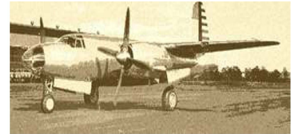
The first B26 Marauder