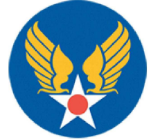
U.S. Army Air Corps crest

In January of 1939, the United States Army Air Corps issued a specification (Circular Proposal 39-640) for a twin-engine medium bomber. Requests for proposals were widely circulated throughout the industry and responding companies included Martin, Douglas, Stearman, and North American. The proposal of the Glenn L. Martin Company of Middle River, Maryland (near Baltimore) was assigned the company designation of Model 179.