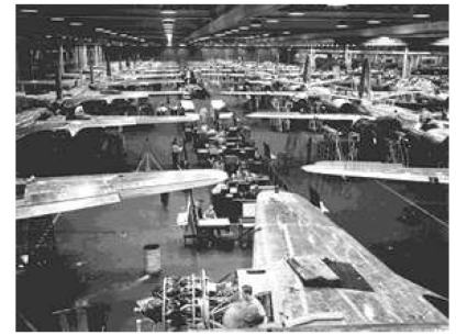
B-26 production line, Middle River, Maryland

On February 22, 1941, the first four B-26s were accepted by the USAAF. The first operational unit was the 22nd Bombardment Group (Medium) based at Langley Field, Virginia, which had previously operated Douglas B-18s. However, several nose gear strut failures briefly delayed transition to full operational status. Although the strut was strengthened, the real problem was improper weight distribution. Due to logistical foul-ups, the first few B-26s were delivered without guns and had to be longitudinally trimmed using tools and spare parts for ballast. When the Army received the planes they removed the ballast, thereby moving the aircrafts' center of gravity forward and increasing loads on the nose gear. Installation of the guns corrected the problem.