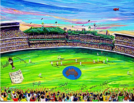
Foster’s Sportsman’s Lunch Auctioned $21,000.00