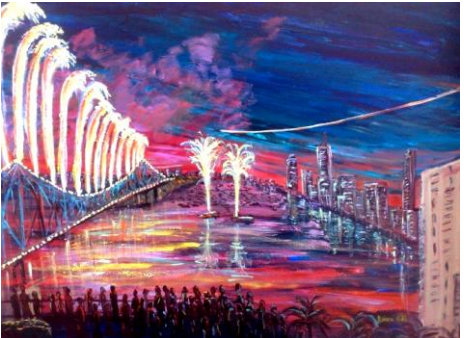
Zig Zag Ball, Auctioned $11,000.00