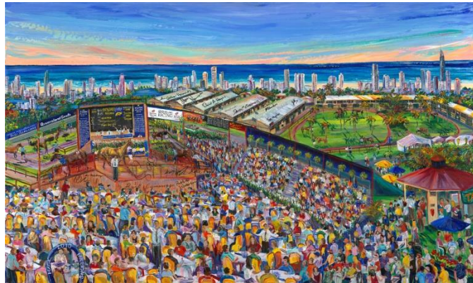
Derby Day, with guests of 3 Degrees Marketing