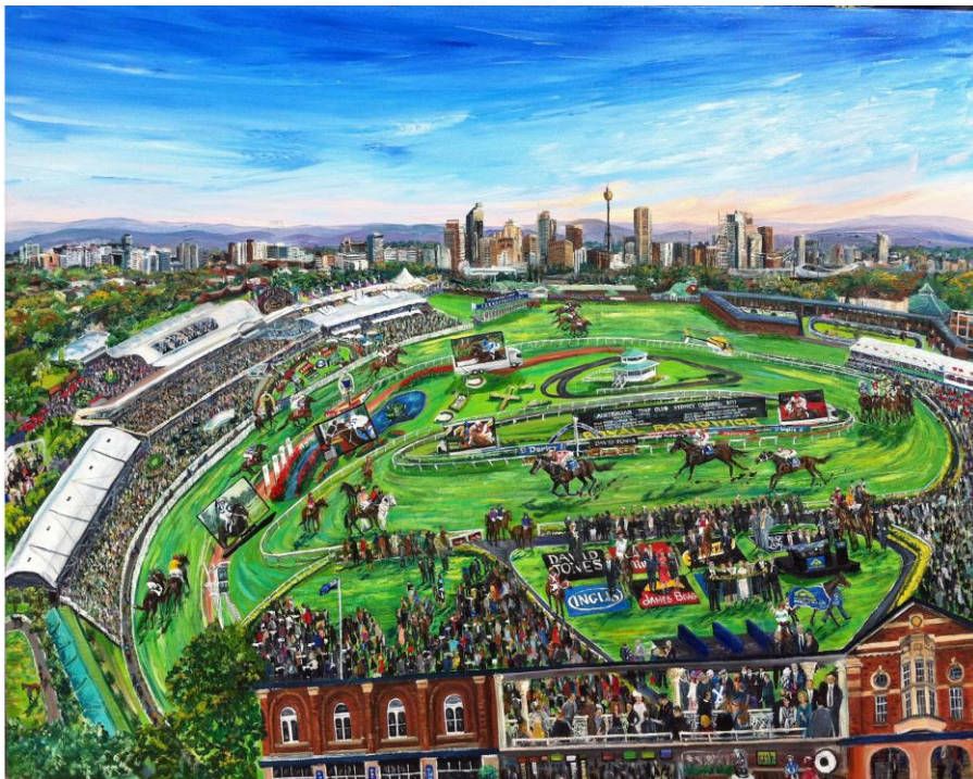
Australian Turf Club Sydney Carnival featuring Black Caviar