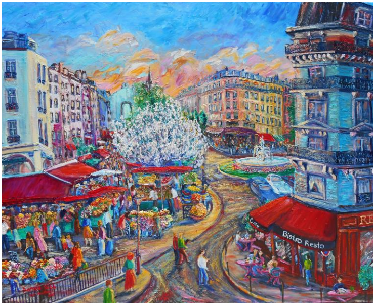
Rue Mottetard Market Scene, Paris