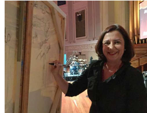
Qld Premier Anastacia Palaszczuk