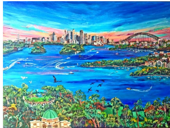
QBE Client event, Taronga Zoo