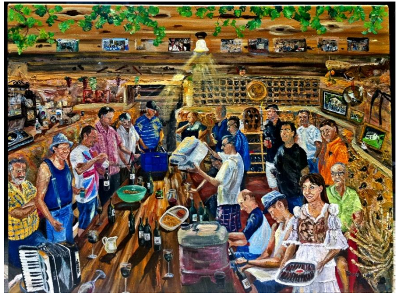
"In the Cellar"