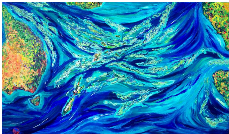
Technology One Conference