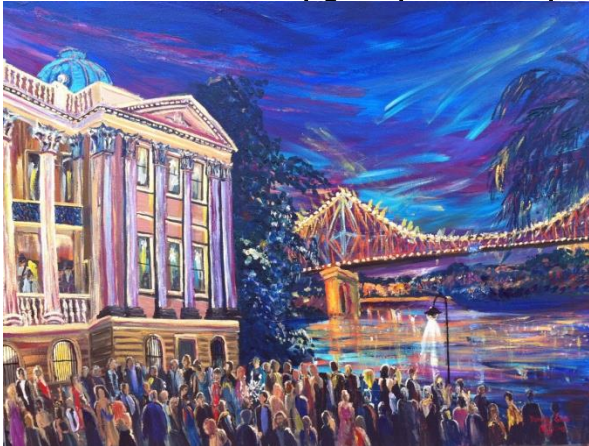
Stand Tall Ball