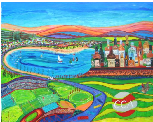
CCA Amatil Conference

Past Clients include, CCA Amatil, Australia Post, Queensland Rail, Lenard's Chicken, Advertising Energy, Technology One, Tourism Queensland, Freehills, RACQ.