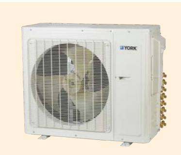
30K BTU/h 208/230V Inverter Heat Pump DHW30CMB21S