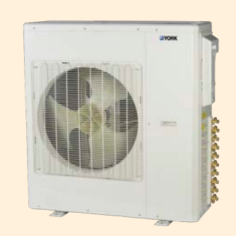
36K BTU/h 208/230V Inverter Heat Pump DHM36CMB21S