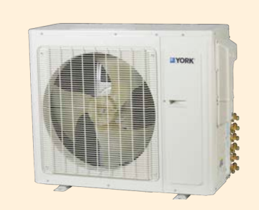
24K BTU/h 208/230V Inverter Heat Pump DHM24CMB21S