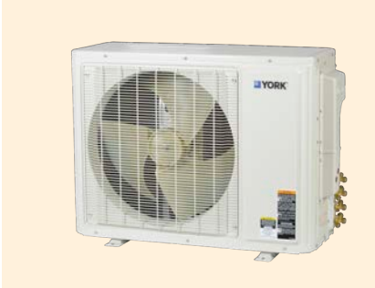
18K BTU/h 208/230V Inverter Heat Pump DHM18CMB21S