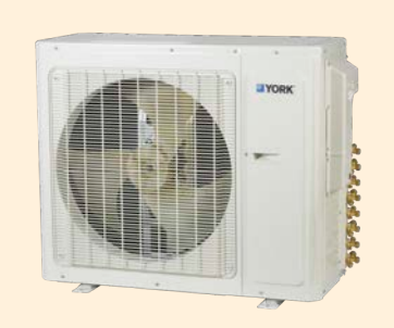
30K BTU/h 208/230V Inverter Heat Pump DHM30CMB21S