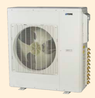
42K BTU/h 208/230V Inverter Heat Pump DHM42CMB21S