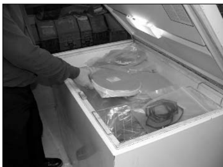
Sealed film bags in freezer. Frozen storage is not advised for reference prints or frequently consulted materials.

Acetate films at the A-D Strip level of 2 (see 2.6) are at a critical threshold in the decay process. At this point the chemical deterioration rapidly accelerates and the artifact soon becomes unusable. Acetate films in advanced decay should be copied immediately or frozen until duplication is feasible.