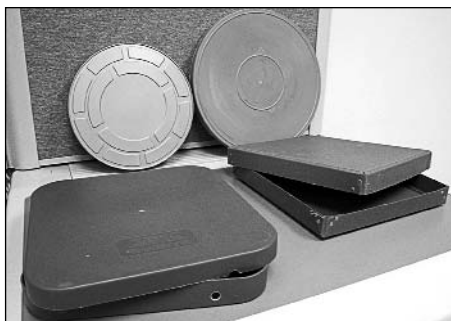
Film containers come in different sizes and designs, some vented to allow air circulation.

Film containers—boxes or cans—should be convenient to use and should protect the film from dust and physical damage. As the physical unit for organizing collections, containers should also provide a rigid surface for shelving and give some measure of fire and water protection. Some also give additional protection in shipping.