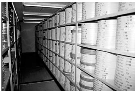
Cold storage vault, set at 40°F and 30% RH, with films shelved horizontally.

COLD STORAGE VAULTS. For large and medium-size collections the best solution is often an insulated cold storage room with humidity control and air circulation. IPI recommends a desiccant-based dehumidification unit that will control humidity for the entire storage area. With this arrangement, no additional desiccants are needed in the packaging of individual films (see 6.6). It is important that the walk-in cold room be used solely for storage and not do double duty as work space. Many repositories protect the security of their cold storage areas with a locked door or security system.