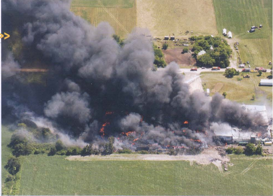
Aerial view looking south shows the defensive attack with heavy streams continuing. The entire six-acre whole-tire storage area is fully involved in fire. The processing building is heavily involved in fire with a partial roof collapse.

awaiting the delivery of the suppression agent, firefighting efforts continued in an attempt to extinguish the fire with water.