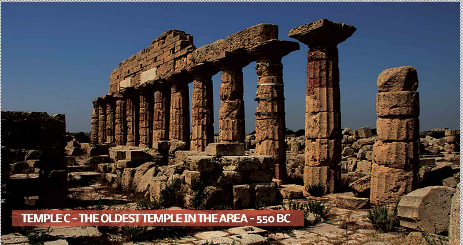
TEMPLE C - THE OLDEST TEMPLE IN THE AREA - 550 BC

Selinunte was one of the most important of the Greek colonies in Sicily . Covering 40 ha, the archaeological park contains five temples centered on an acropolis and invites for further exploration of the surroundings.