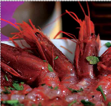
Gina's favourite dish.