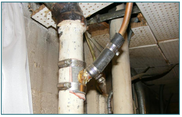
A cross connection between a dishwasher drain (copper pipe) and a main pipe.

Hot water tanks are susceptible to the development of biofilm, which is a surface deposit of bacteria that accumulates creating a slime layer. Similar to the plaque that forms on teeth biofilms accumulate over time. It is recommended that you consult with an experienced professional to have your hot water tank periodically cleaned to remove existing biofilms and sediments.<sup>2</sup>