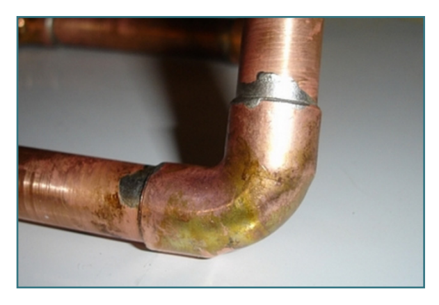
Copper pipes joined by lead solder.