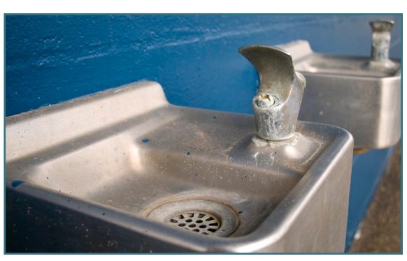
Lime build-up on mouthpiece and protective guard of drinking fountain.

It is also important to clean drinking water fountains to remove lime and calcium build-up. Lime and calcium build-up can begin to block