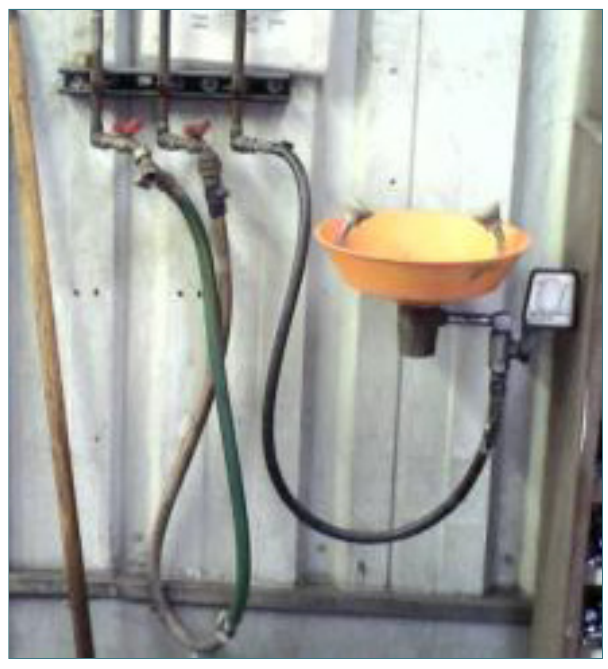
A garden hose creates a dangerous cross connection between potable and non-potable water.