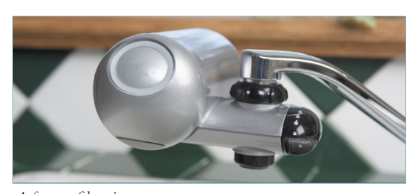
A faucett filtration system.