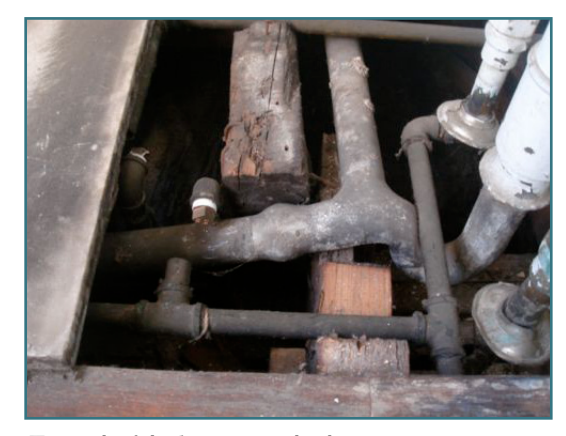
Example of lead pipes in a plumbing system.

Municipal water systems take steps to reduce the corrosiveness of the water. However, if the plumbing in your facility is made of lead or contains lead parts, corrosion may occur as the water moves through your facility's plumbing.