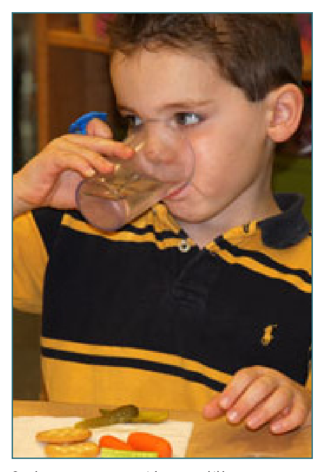
Lead exposure poses a great risk to young children.

EPA developed the 3Ts for Reducing Lead in Drinking Water in Schools, Revised Technical Guidance (Training, Testing and Telling) to help schools and child care facilities implement simple strategies for managing the health risks of lead in drinking water. The 3Ts include: