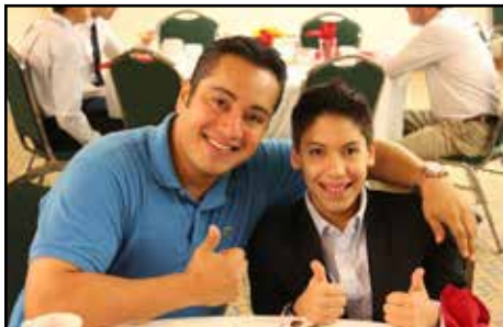
Parent and student give "thumbs up" for NSSB.

envisioned a competitive event. It has evolved into much more. It has brought families together as they travel to the Bee and participate in the activities, and most importantly, it has brought together students of various ethnicities and from throughout the country to compete in a Spanish spelling bee."