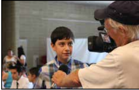
The Press interviews one of the students.