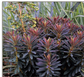
Euphorbia amygdaloides 'Purpurea' Bracts lime green, full sun rich purple foliage, to 18", mound forming