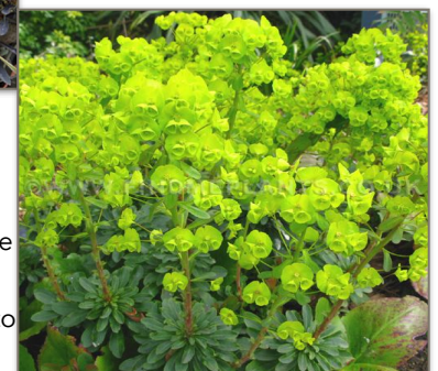
E. amygdaloides var. robbiae (Mrs. Robb's spurge) Good for dry shade bracts yellow-green, dark green foliage year round, to 18", spreads quickly on loamy soil