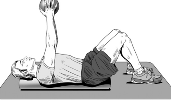
Figure 4 Vertical Foam Roll – Chest Press – Common Mistake – failing to reach up all the way.