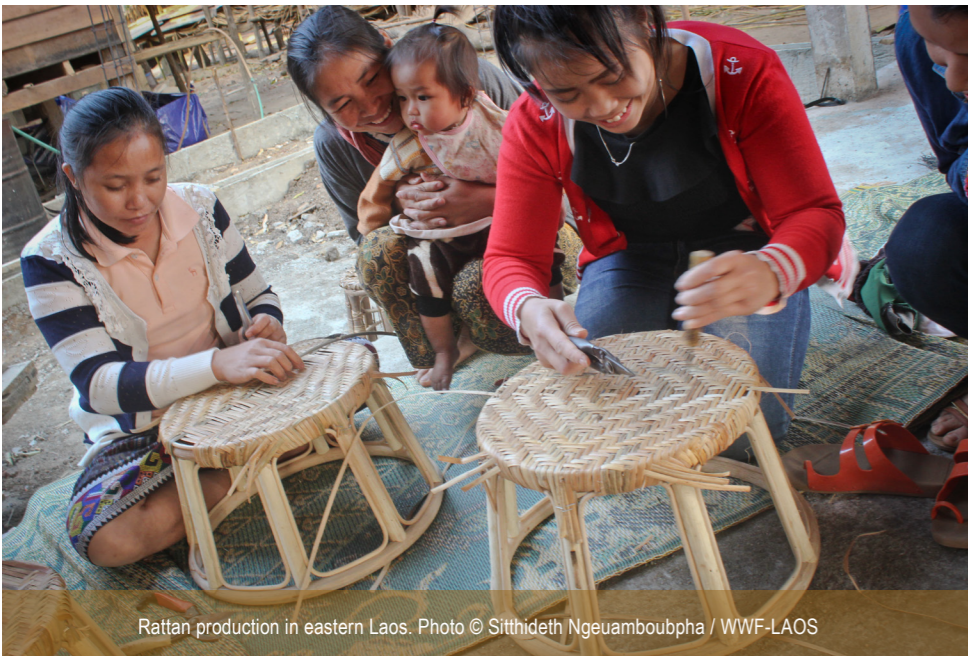
Rattan production in eastern Laos.

In Laos, WWF will partner with Village Focus International, which has worked on the Laos-Vietnam border for more than 10 years to train communities with regard to their rights in governance and natural resource management. WWF will also coordinate with GIZ's 'Support to Laos-EU FLEGT Process' project, which has primarily focused on government engagement, and dissemination of key findings to SMEs, forest-dependant communities and civil society.