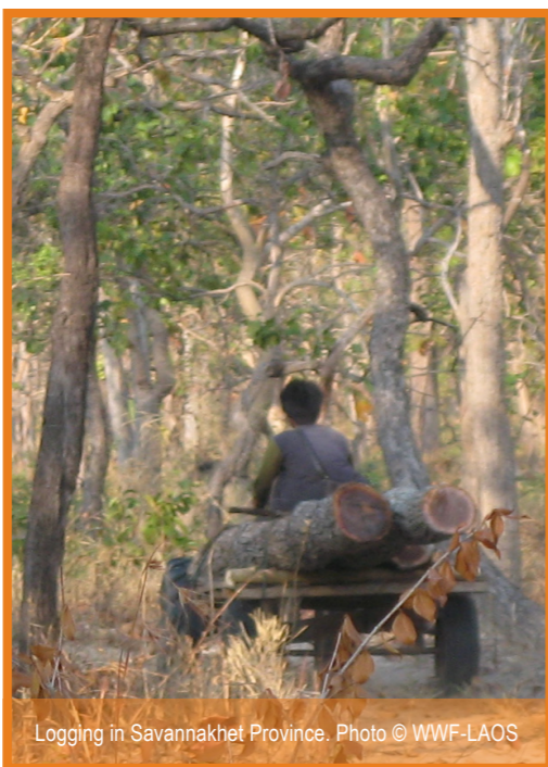
Logging in Savannakhet Province.

Illegal logging is the greatest threat to forest preservation worldwide, with an estimated 30 million acres of natural forest destroyed globally each year to meet the growing demand for wood and agricultural products. In Laos & Vietnam, Illegal logging undermines ecosystem services that underpin national economies, deprives the world's poorest communities of critical income, and denies many forest-dependent communities access to forest resources on which they rely.